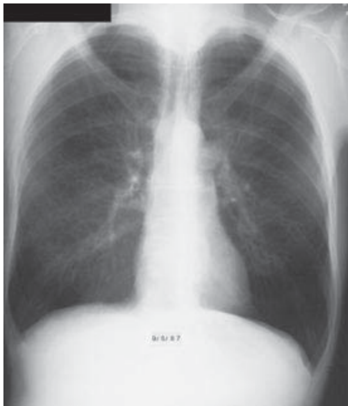
FIGURE 1. Posteroanterior chest radiograph of a patient with severe deficiency of alpha-1 antitrypsin (PI*ZZ phenotype). Hyperinflation is demonstrated by flattening of the diaphragm. Note that the hyperlucency is more evident at the base of the lungs than at the apex. This finding is characteristic and suggestive of alpha-1 antitrypsin deficiency but is seen in only a minority of chest radiographs.

severely deficient. 1,2 Furthermore, among whites, the prevalence of carriers (heterozygotes) of the most common severe deficiency allele, the so-called Z, is approximately 2% to 3%, suggesting that approximately 8 million Americans have an at-risk allele.